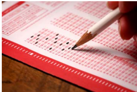
The College Board SAT uses OMR technology

OMR technology detects the existence of a mark, not its shape. OMR forms usually contain small ovals, referred to as 'bubbles,' or check boxes that the respondent fills in. OMR cannot recognize alphabetic or numeric characters. OMR is the fastest and most accurate of the data collection technologies. It is also relatively user-friendly. The accuracy of OMR is a result of precise measurement of the darkness of a mark, and the sophisticated mark discrimination algorithms for determining whether what is detected is an erasure or a mark.