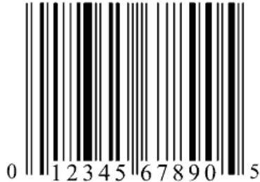
1D barcode Universal Product Code (UPC)

A barcode is a machine-readable representation of information. Barcodes can be read by optical scanners called barcode readers or scanned from an image using software. A 2D barcode is similar to a linear, one-dimensional barcode, but has more data representation capability.